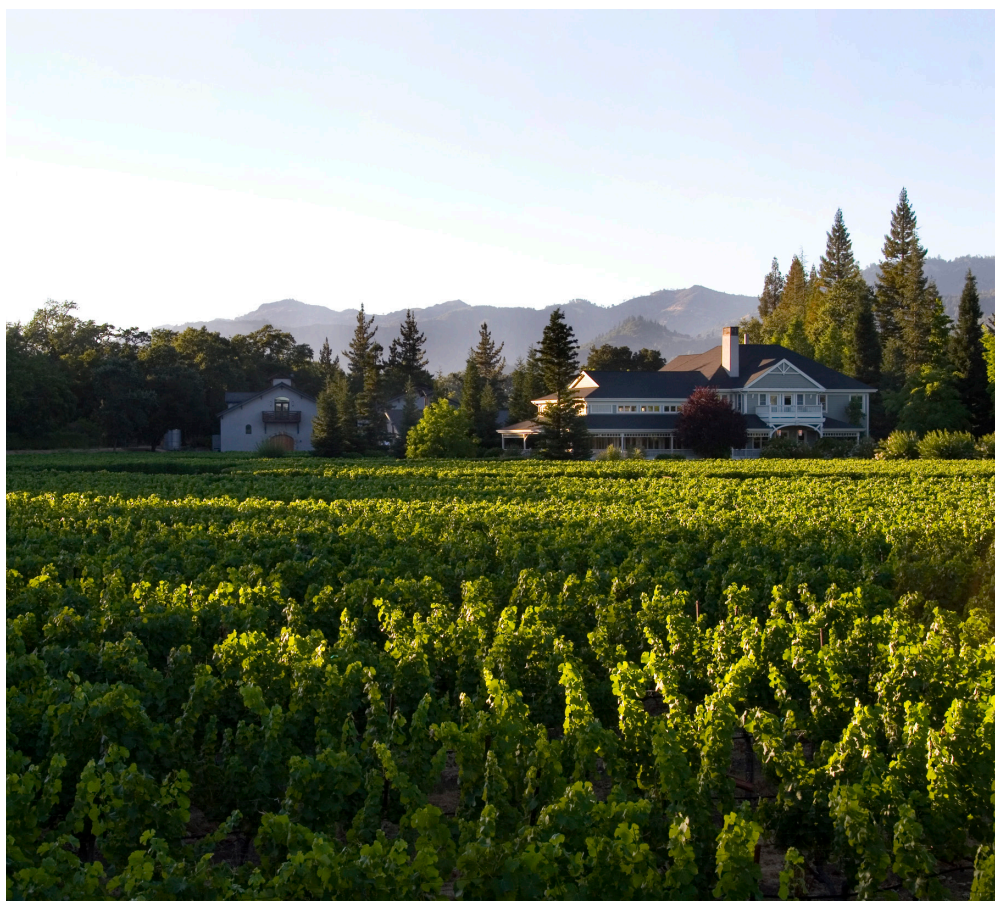
THE DUCKHORN ESTATE IMAGE: DUCKHORN VINEYARDS