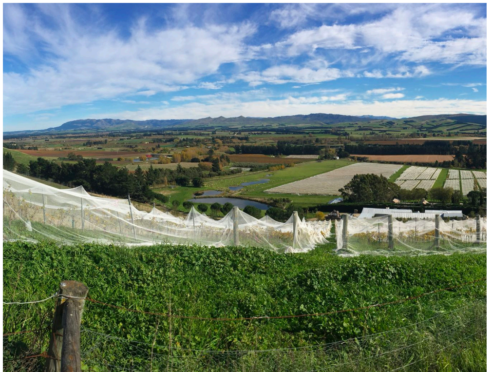
THE MOUNTFORD HILL IMAGE: MOUNTFORD ESTATE

Matured in old French oak for 12 months.