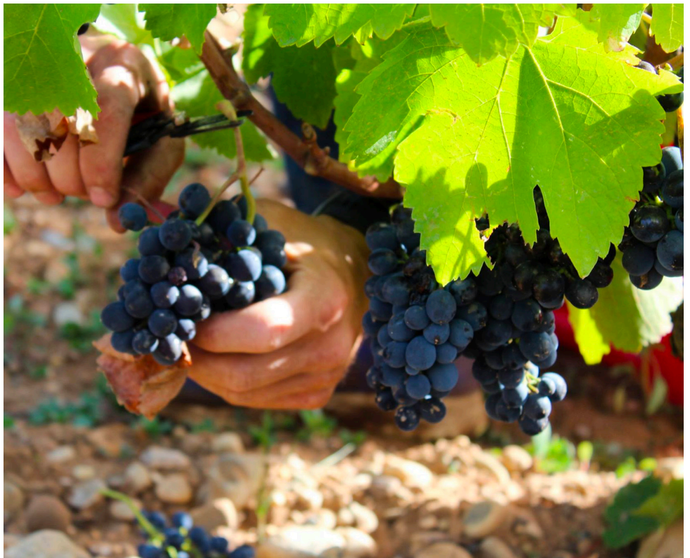
HARVEST OF THE JABOULET GRAPES

20% in French oak casks and stainless steel tanks during 12 months.