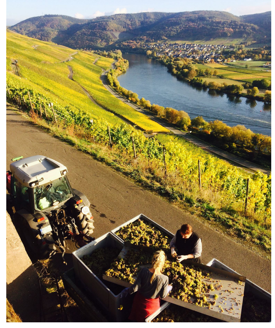
GRAPES ARE PICKED & SORTED OVERLOOKING THE MOSELLE RIVER