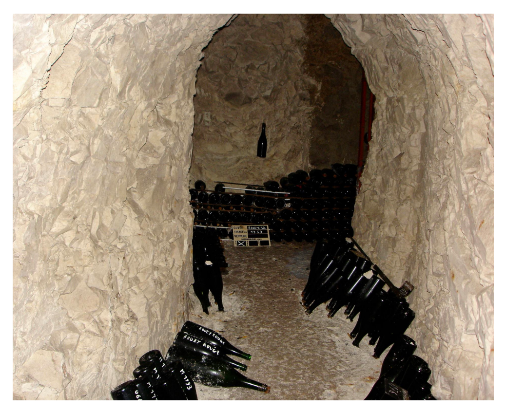
ANDRE CLOUET'S CELLARS IMAGE: CHAMPAGNE ANDRE CLOUET

The wine is aged in the cellars of the family to 10 feet deep, with disgorgement removed and manuals.