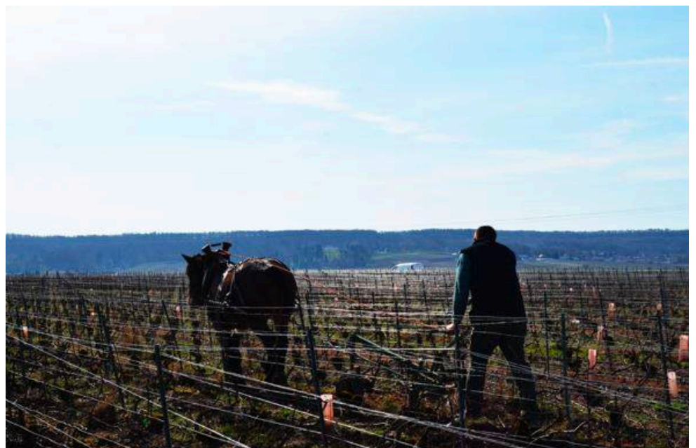
THE CLOS DU MOULIN VINEYARD BEING TENDED TO