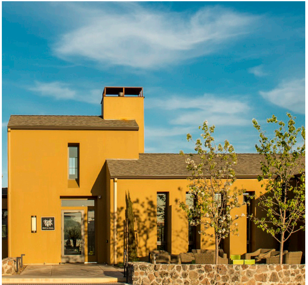
THE PATZ & HALL WINERY

Sur lie aged with weekly stirring, 32% new Burgundian French oak barrels.