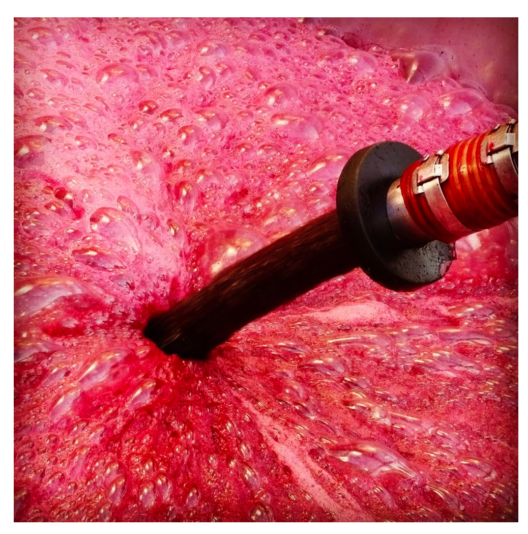
Pump overs